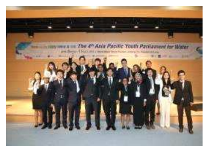
Group Photos at the closing ceremony