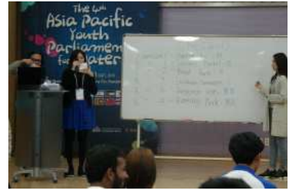
Election for the Chair Group