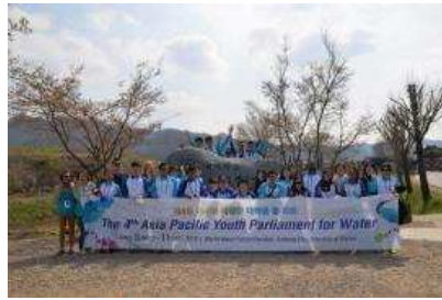
Filed Visit (Hahoe Village)