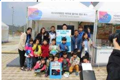
Participation in the 7 th World Water Forum