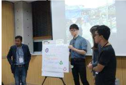
Committee Activities (Discussion)