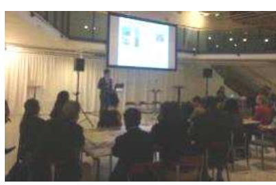
Participation in the 2015 World Water Week in Stockholm