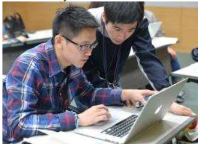
Committee Activities (Writing a statement)