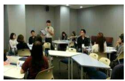
Organizing the Youth Session at the Chuncheon International Water Week